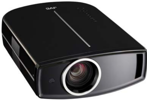
DLA-HD750-B (disponibile solo nero)