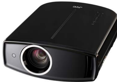
DLA-HD350-B/W (disponibile sia nero che bianco)